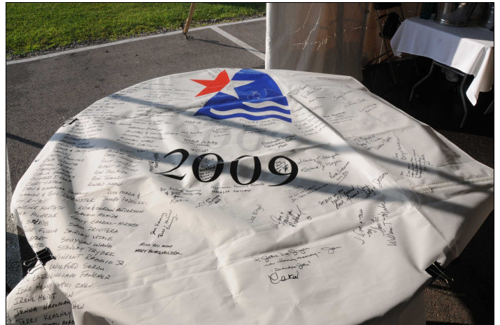
Hundreds of names and messages about loved ones who have died were written on the 2009 Memorial Sail at Rochester's 11th annual Hospice Regatta.